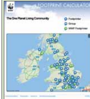
WWF-UK's online One Planet Living community

People from all over Britain have also logged onto WWF's new 'Footprint Calculator Forum' which not only reveals people's impact on the planet but also provides help and encouragement for them to reduce their impact.