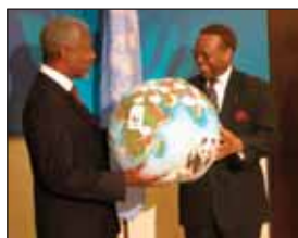
HE Chief Emeka ANYAOKU, President WWF International with former UN Secretary-General Kofi ANNAN

One Planet Business – part of the One Planet Living joint initiative between WWF and BioRegional – was presented to