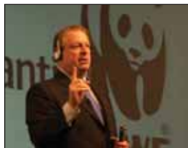
Al Gore at WWF event in Turkey